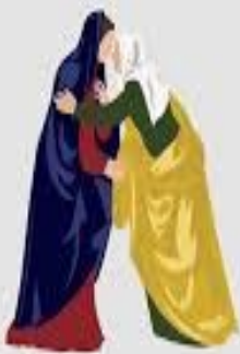
Feast of the Visitation of the Blessed Virgin Mary (May 31st)

The Trinity is not a puzzle to solve but the blazing Truth at the center of everything: the Father gives the Son for you and me. Lord, help us to see this more clearly.